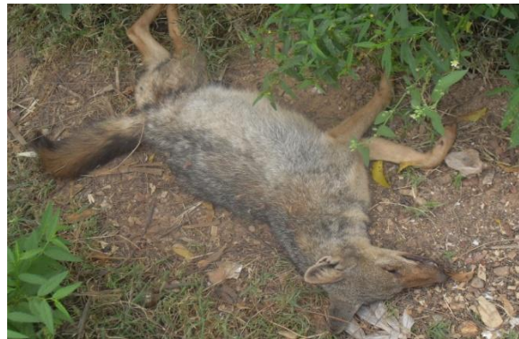
Plate II. Photograph of a jackal ( Canis aureus ) Killed in a farm land.