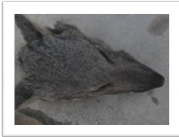
Plate I. Photograph of head of jackal ( Canis aureus ).

P Value 0.6809, OR 0.8116, CI (0.1538- 4.283).