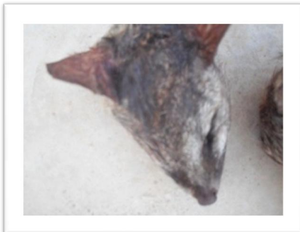
Plate III. Photograph of head of a mongoose (Mungos mungo).