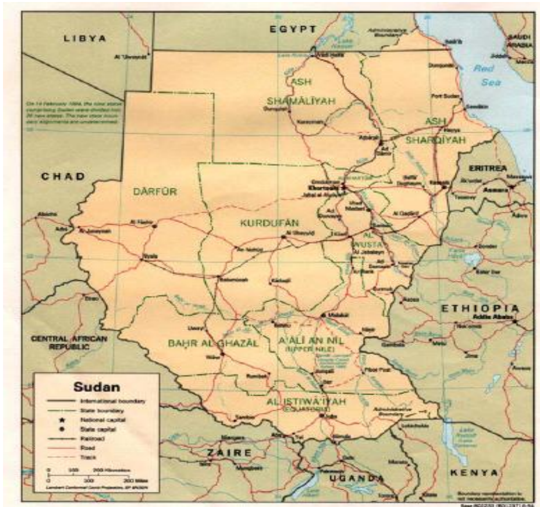
Fig. 2. Map of Sudan.

The amount of water recharged annually is estimated to be 20.6 \times 10^6 \text{ m}^3 (Salih, 1984). Wadi Hawar region, which forms the southern margin of the Sahara area, is a promising area for further development and further detailed studies.