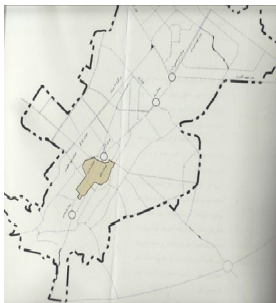
Fig. 1. The studied area.

The city of Kermanshah is located between 34 degrees and 19 minutes northern latitude and 47 degrees and 7 minutes eastern longitude of Greenwich meridian. Height of the city from sea level is 1322 m. Kermanshah is located in the central part and is limited from north to Miyan Darband Rural District, from south to Dorud and Faraman and Qarah Su Rural District, from East to Mahidasht District and Baladarband District and from West to Bisotun District. (Statistical Year Book 1385) In 1390, the city's population of over 851,405 people. In Aban 1390 in Kermanshah Family size was 4 people. (Statistics part State Government Office, 1390) Faizabad is one of the oldest neighborhoods samples that have formed around the historic center of the city and its history goes back more than a hundred years ago. Faizabad district with an area of about thirty-three acres is located in the northeast of the central tissue and is limited of north to Silo and Amiri Streets, from south to Nawab Street, from East to Jalili Street and from West to Modares Street.