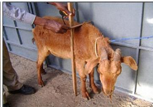
Fig. 2. Measuring withers height.