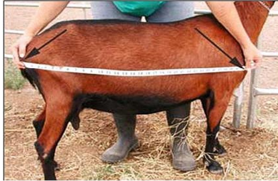
Fig. 3. Measuring body length.

BL was measured using a tape measure, while RW, SW and HW were measured using a calliper. In order to avoid individual variation, same person took the measurements.