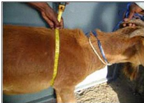
Fig. 1. Measuring heart girth.

Animals weights (body weight) and the following morphometric measurements were taken: wither height (WH), body length (BL), heart girth (HG), shoulder width (SW), head width (HW), rump width (RW), and rum length (RL). Body weights were taken in the morning before grazing and watering. Heart girth measurements were taken around the chest just behind the front legs and withers using a tape measure (Fig. 1). Wither height was measured using a measuring stick while an animal stood on a platform (Fig. 2).