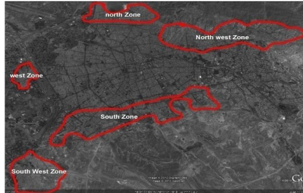
Fig. 2. Descriptive and master plan for Tabriz metropolice.