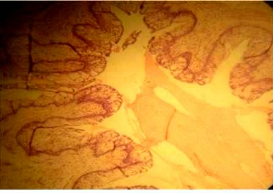
Fig 2b: Section of the uterus of the pregnant animals in the control group showing thick endometrial layer with tortuous endometrial glands (H&E x520)