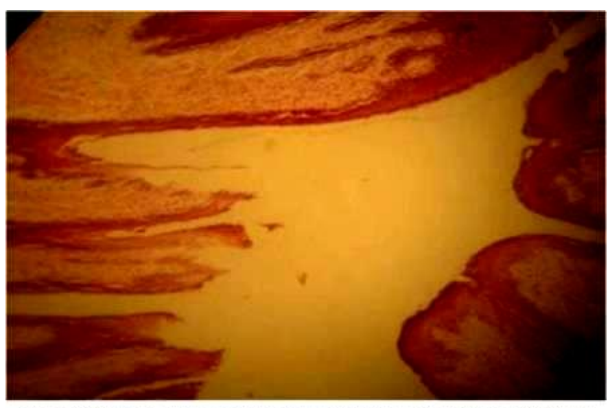
Fig. 2a: Section of the uterus of the pregnant animals treated with artemether showing thin endometrium with straight endometrial glands (H&E x520)