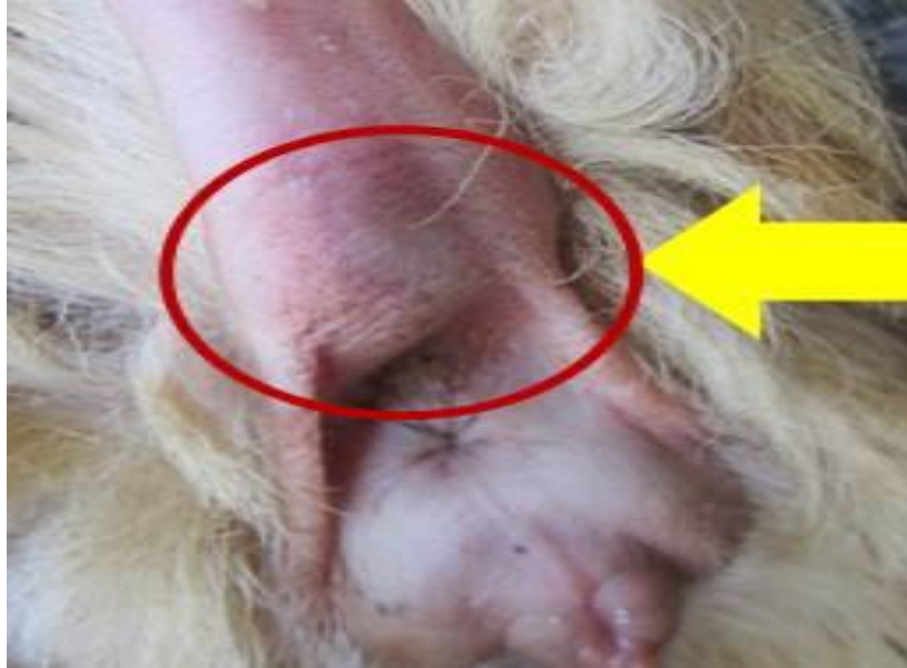
Fig. 3. Negative Control (No Swelling).