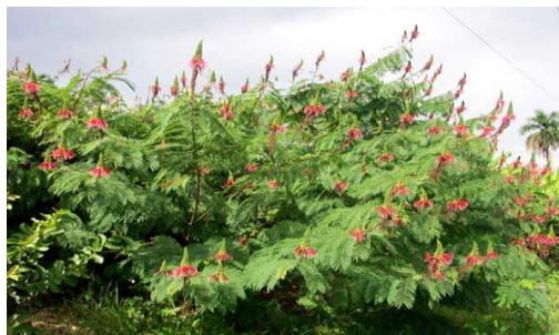
Fig. 1. C. calothyrsus shrub ( https://topropicals.com/catalog/uid/calliandra_calothyrsus.htm ).

Several strategies can be used to increase digestibility, which include: Physical treatment, biological treatment and chemical treatment (Sarnkolong et al., 2010; Usha et al., 2001). Urea treatment is a chemical method that has however emerged as a treatment method of choice for use especially on farms in the tropics for smallholder farmers (Ambaye, 2009). It is preferred due to its low cost and ease of handling (Nianogo, 1999). Urea treatment can serve as a delignification process through ammonification and is also a source of nitrogen (Vadiveloo and Fadel, 2009). The effect of urea treatment on chemical composition of forage legumes has not been fully elucidated on C. calothyrsus . The tendency has been to extrapolate from known effects on maize stover. This is problematic given the differences between maize stover and leguminous forage trees. A major difference between maize stover and legumes cited by Van Soest (1994) is that whilst legumes often contain a higher content of lignin than grasses, only the xylem vascular tissues are lignified. In general, legumes tend to be higher in lignin and crude protein and lower in cell wall than tropical grasses. In grasses, lignin is distributed throughout the plant tissue (Wilson, 1993). This research therefore sought to investigate the effects of graded levels of urea treatment on nutrient composition and in-vitro digestibility of C. calothyrsus leaves.